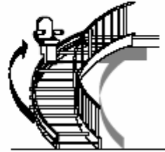
■ Curves and spirals